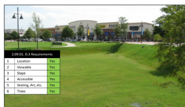
Figure 1: Example of a detention/retention pond designed as an amenity